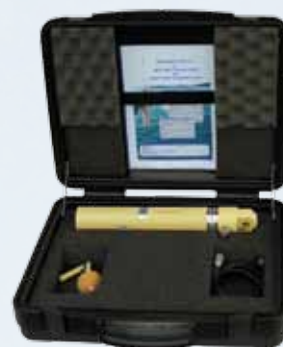
TD304 in it's case

For remote readout and monitoring, the manufacturer offers several options: Communication Unit CU901, for two-way communication via Iridium satellite, GPRS with embedded web server, GSM and UHF/VHF,