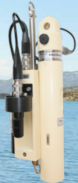
SD204 with optional sensors