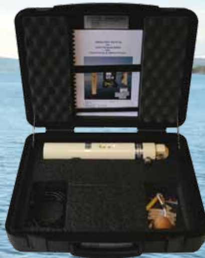
SD204 in transport/storage case